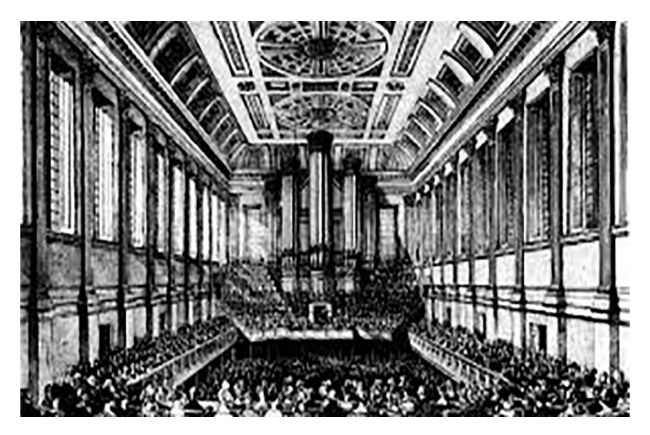
The first performance of Elijah in 1846 as part of the Birmingham Festival, with the composer conducting