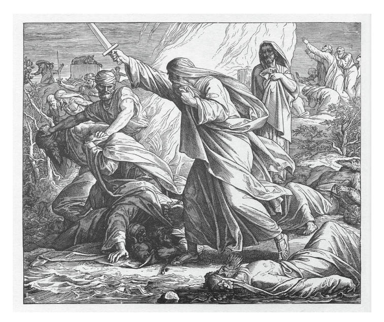
Elijah slays the prophets of Baal

Finally, the Tenor aria "Then shall the righteous shine forth" heralds the joyful conclusion to the oratorio, with the great chorus of praise "Lord our Creator, how excellent thy name is" ending this majestic masterpiece.